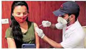
AHMEDABAD: While putting an end to proceedings on various PILs related to Covid-19 after the second wave seems to have receded, the Gujarat high court on Friday observed, "As the whole nation witnessed, the second wave spread like wildfire and damaged the very fabric of the nation to a great extent." The court further noted that thousands of people in the state lost their lives and hundreds are still suffering due to its after-effects and complications of mucormycosis. "The second wave has entailed a very dismal, depressing, and gloomy state of affairs in the entire nation. The loss of lives in such a huge number has left permanent deep scars on the psyche of people," it noted in its order.