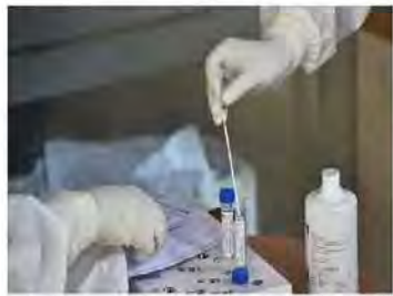
Gandhinagar: A day after crossing the mark of 5 lakh, vaccination figure in Gujarat dropped to 3.55 lakh on Friday. The state reported 36 new cases of Covid-19 in 24 hours.

in the state currently, of which 5 patients are on ventilator and 340 are stable. Ahmedabad city reported 8 cases. There were 7 cases in Surat district, including 5 in city and 2 in rural parts. Vadodara city reported 4 cases, Rajkot and Junagadh 2 each, Jamnagar, Bhavnagar and Gandhinagar 1 each. Surendranagar reported 2 cases, Sabarkantha, Anand, Dahod and Gir Somnath 1 each. A total of 61 patients recovered from Covid-19 on Friday, taking the number of recoveries so far to 8,14,223. The recovery rate has reached 98.74 per cent. The number of Covid-19 vaccines administered during the day dropped sharply to 3,55,953. The overall vaccination figure till now has reached 3.10 crore.